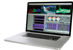
Avid Media Composer