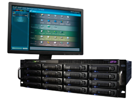
Avid ISIS 5000